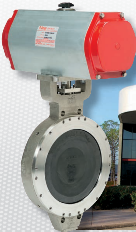
Metal Seated Wafer Valve

Bray offers a full range of electric and pneumatic actuators with accessories to meet your modulation and control needs.