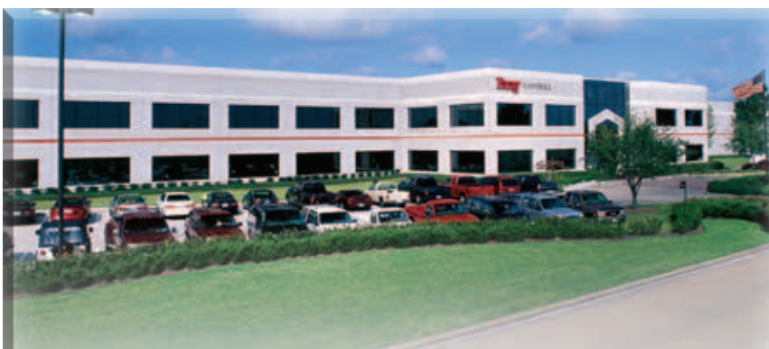
▲ WORLD HEADQUARTERS - BRAY INTERNATIONAL, INC. - USA