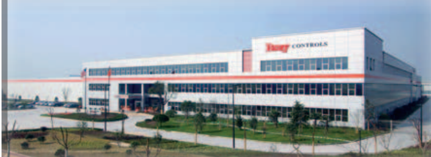
▼ BRAY CONTROLS - CHINA - Office & Manufacturing

To serve you locally, each region maintains a factory certified sales and service network for all Bray International products.