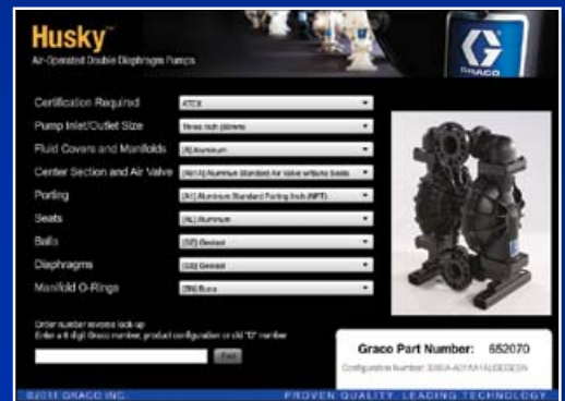
Example of Product Selector Tool

To order a Husky 3300 pump, go to www.graco.com/husky to use the selector tool or contact your distributor.