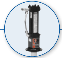
Hydraulic Dyna-Star Pump – 2000